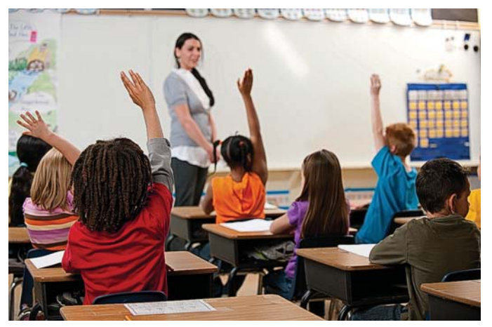
Fig. 2. Classroom background sound levels are significantly affected by heating, ventilation and air conditioning systems.

In 2009 and 2010, the standard was revised.<sup>3</sup> This time,