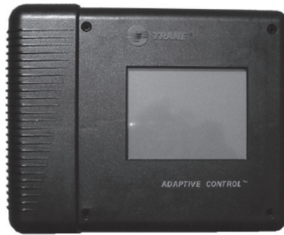
Figure 1 - Operator interface