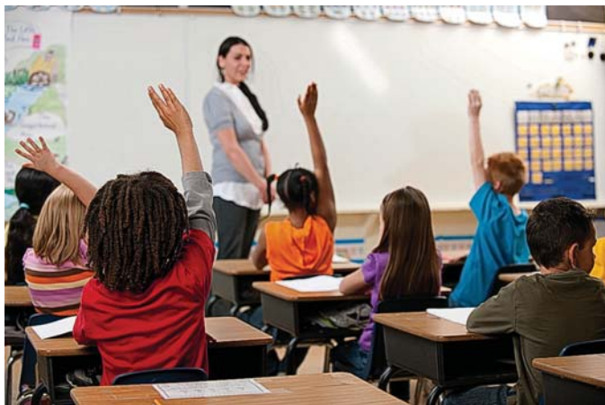
Fig. 2. Classroom background sound levels are significantly affected by heating, ventilation and air conditioning systems.

In 2009 and 2010, the standard was revised. 3 This time,