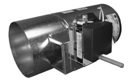
Bypass damper with wire and quick connect

Regardless of economic conditions, one thing remains constant: a company's success and bottom line depend on tenant and employee satisfaction.