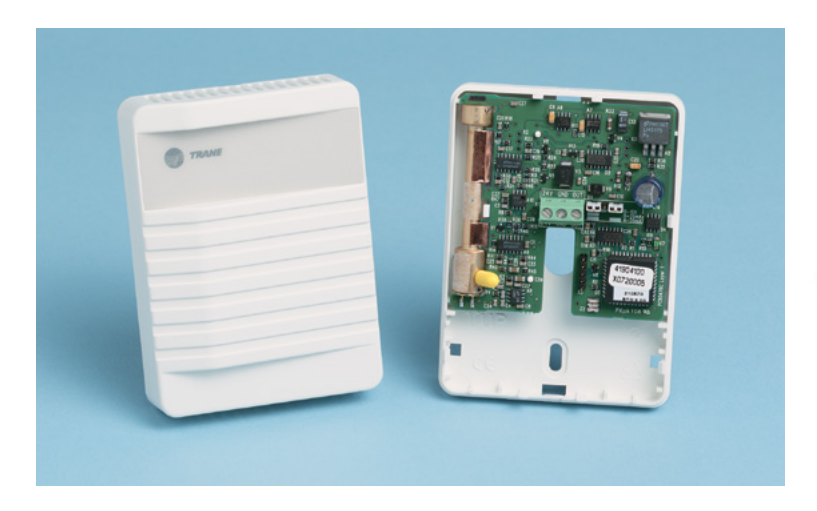
CO2 wall sensor for demand control ventilation

VariTrac<sup>™</sup> changeover-bypass zoning systems are completely integrated with Trane unitary equipment. This integration provides you a one-stop shopping experience for your comfort system, with simplicity as a key benefit.